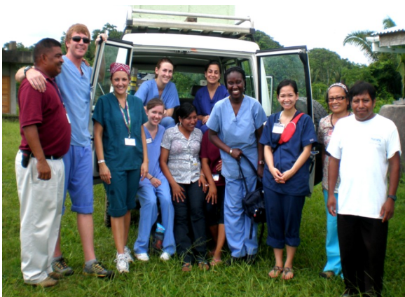
Preparing for a Mobile Clinic Visit