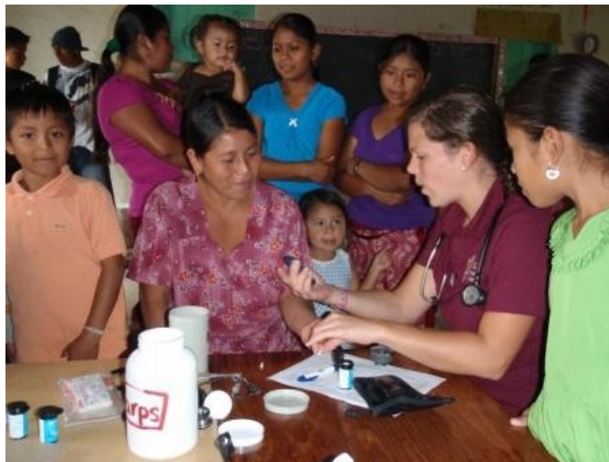
Diabetes Screening in San Jose